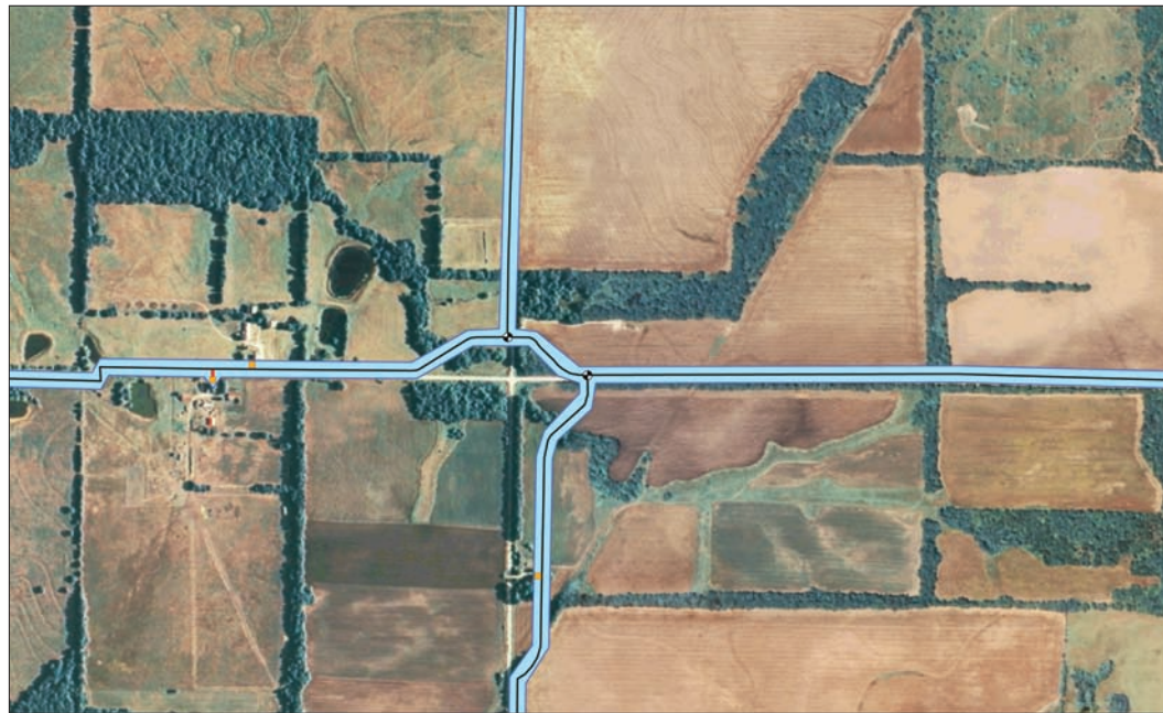
This map shows the buffer (in blue) around the main water distribution pipeline that runs through a section of the Labette RWD 3. Kansas One Call will use this file to notify excavators when any locate request is made that is within the tolerance zone.

Dale Newland with Labette RWD 3 called to inquire about joining Kansas One Call. KRWA had collected digital data for Labette RWD 3 and Dale was asking if that data could be sent to One Call Concepts. I informed Dale that OCC would not accept line and point data for their database but will accept and they prefer digital polygon files. It takes some time to merge the service lines, main lines and any other lines (abandoned, out-of-service, etc.) and then create a buffer around those lines, which will then be turned into a polygon for One Call. But, the system is able to decide what