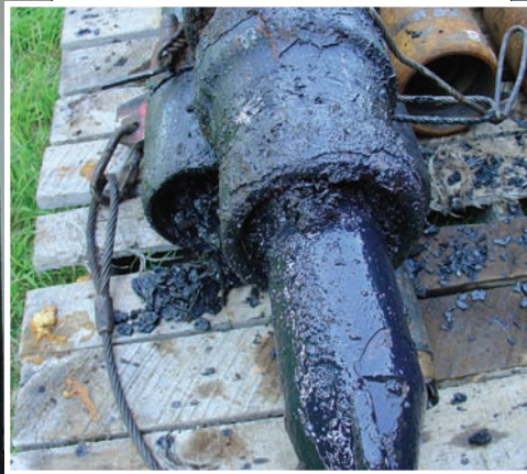
Not very appealing, this photo shows the iron and manganese buildup on the old pump.