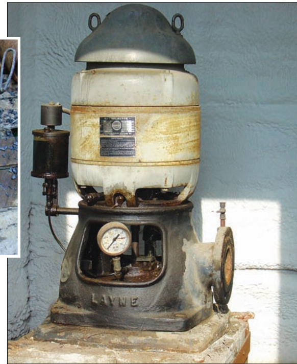
This 10-HP 3-phase motor operated the well that provided supplemental fire supply water to the town of Morrill.

Initially, when the switch was turned on the flow of water was very good. It appeared that a pat on the back was due to everyone involved. However, the elation did not last long because the flow of water dwindled to less than half of the amount anticipated. That was not how it was supposed to be! All the components were new and the production should be just as good as prior to the work.