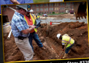
Success Story #326