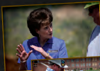
Success Story #187

Non-Profit Organization U.S. Postage PAID Permit No. 580 Manhattan, KS 66502