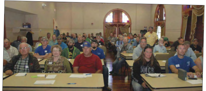
It's a full house! The cameraman had his back to the wall ...and the lens was filled with the 88 people who attended the training session in McPherson on Friday, October 9. The training was held at the Opera House in downtown McPherson.

Systems attending included: Barton RWD 2, Brickley Enterprises, Buffalo Hills Park, city of Buhler, city of Burrton, city of Claflin, city of Delphos, city of Ellsworth, city of Enterprise, city of Florence, city of Goessel, city of Haysville, city of Hutchinson, city of Inman, city of Liberal, city of Lindsborg, city of Little River, city of Macksville, city of Mount Hope, city of Nashville, city of Newton, city of Salina, city of Sedgwick, city of Solomon, city of South Hutchinson, city of Sylvan Grove, city of Sylvania, city of Towanda, city of Valley Center, city of Walton, city of Wichita, Coffey RWD 3, Ellsworth RWD 1, H.E.I., Harvey RWD 1, HD Supply Waterworks, Marion RWD 1, McPherson RWD 4, Morris RWD 1, Reno RWD 4, Saline RWD 1, Falun and Veolia Water.