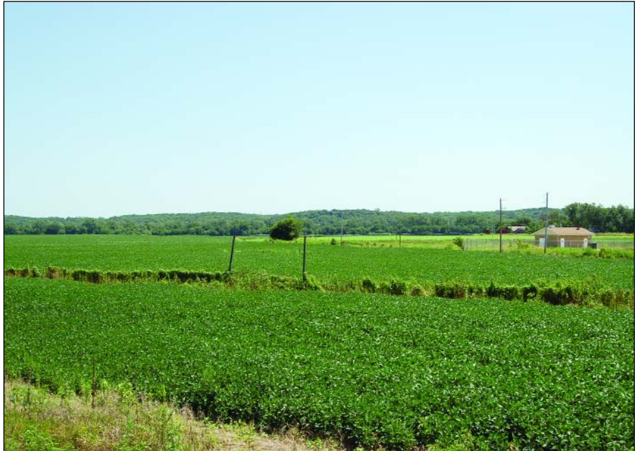
This part of the Kansas River Valley was proposed to be the location of a Lafarge North America Inc. sand and gravel extraction project. The well house for Leavenworth RWD 7 can be seen at the right of this photo.

Because these stream channel alluvial aquifers have well sorted material, are easily recharged by precipitation and stream flow, and generally store good quality water, they are excellent sources of water for irrigators, industries and public water systems. A count of the number of wells in the Kansas Department of Agriculture - Division of Water Resources database finds that there are at least 3,300 water wells tapping an alluvial aquifer in Kansas.