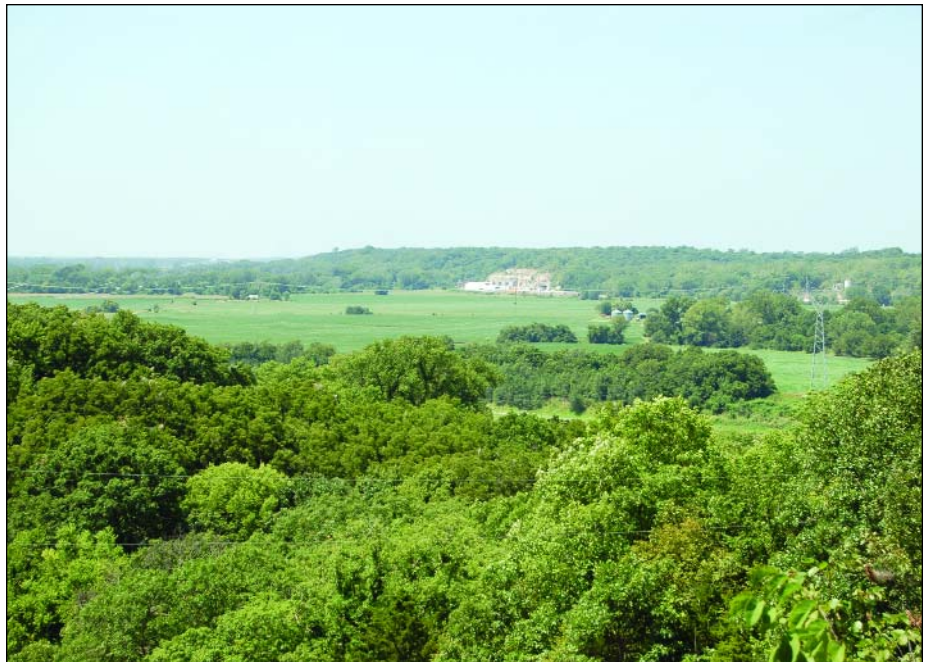
Looking west from Johnson County over the Kansas River which is hidden by the trees, one can see the location originally proposed to be the site of a sand pit which was be approximately 180 acres in size after the project was completed.