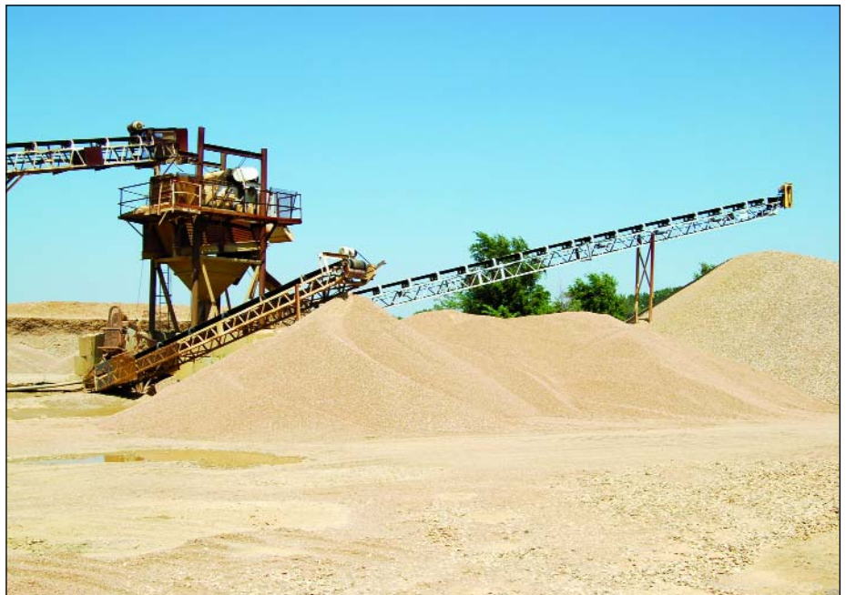
This quarrying machinery east of Topeka is typical of sand and gravel extraction projects. After material is pumped from the pit, it is run through a series of sorters, resulting in piles of uniform sized sand and gravel for various uses.

District 7 worked with Lafarge directly to find a solution to their concerns before the zoning hearing. The development of a solution before a potentially emotional hearing was held would likely be more successful. District 7 had their geologist review the information provided by Lafarge, and it was determined that the district would ask for the pit to never be any closer than 1,000 feet