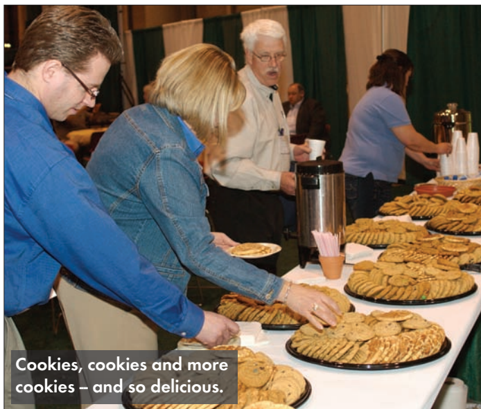
Cookies, cookies and more cookies – and so delicious.