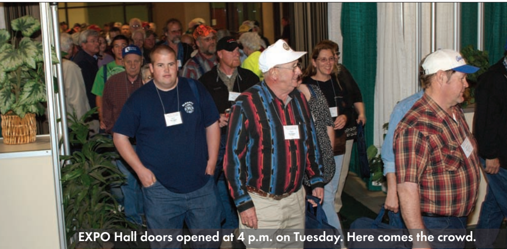
EXPO Hall doors opened at 4 p.m. on Tuesday. Here comes the crowd.