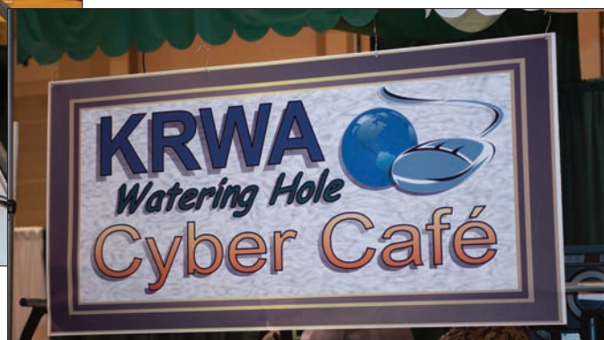
The Cyber Café hosted six computers. EXPO Hall is also totally wireless for the KRWA conference.