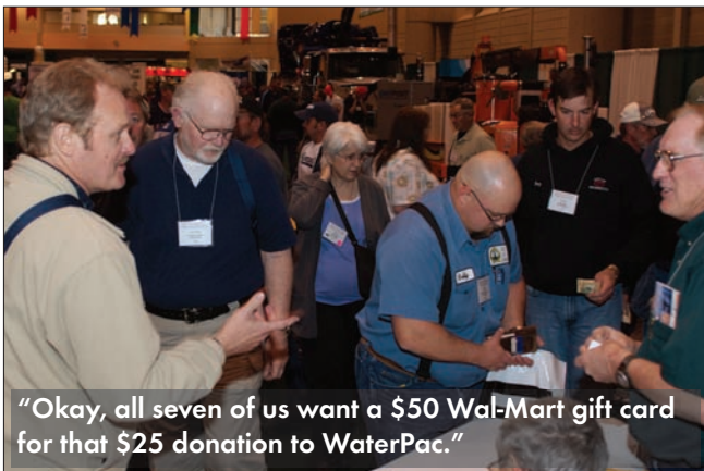
"Okay, all seven of us want a $50 Wal-Mart gift card for that $25 donation to WaterPac."